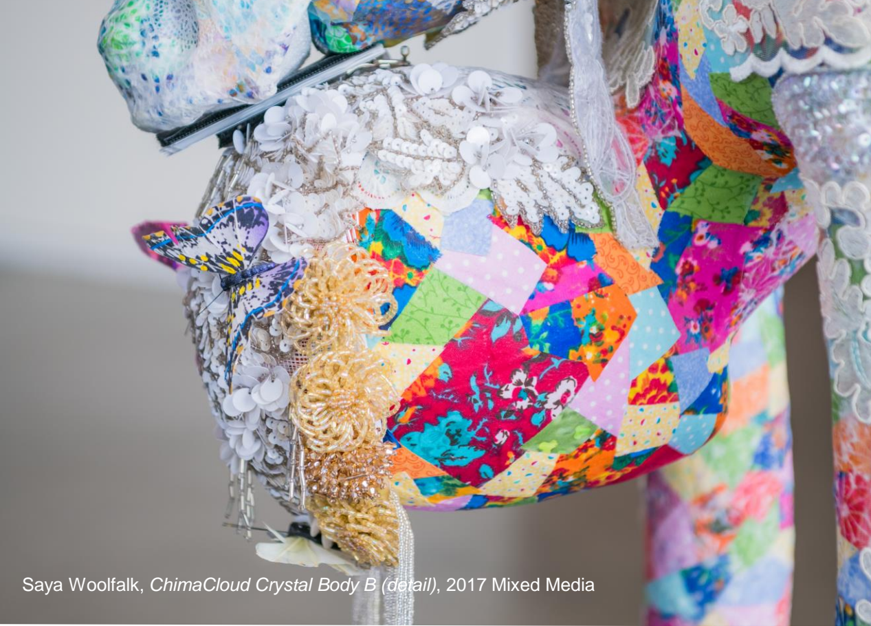
Saya Woolfalk, ChimaCloud Crystal Body B (detail) , 2017 Mixed Media