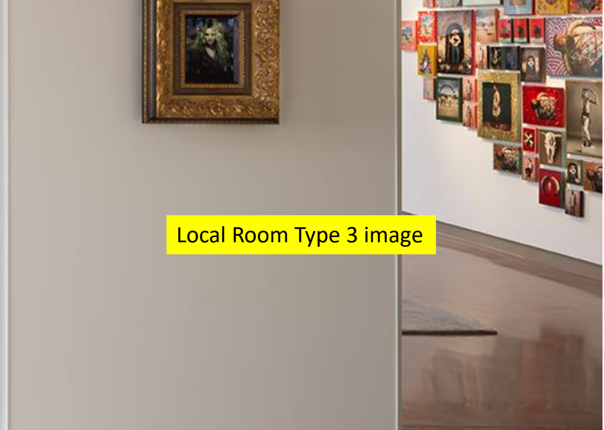
Local Room Type 3 image