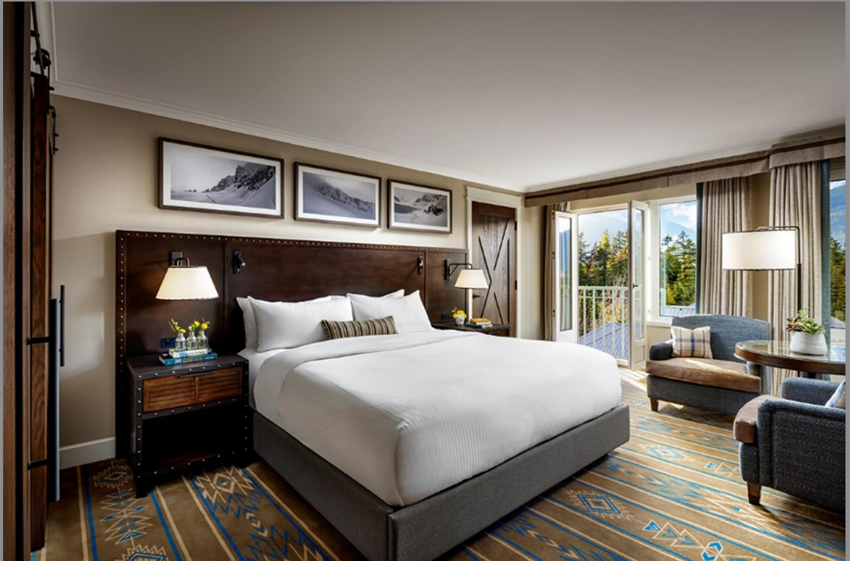
Newly renovated guestroom