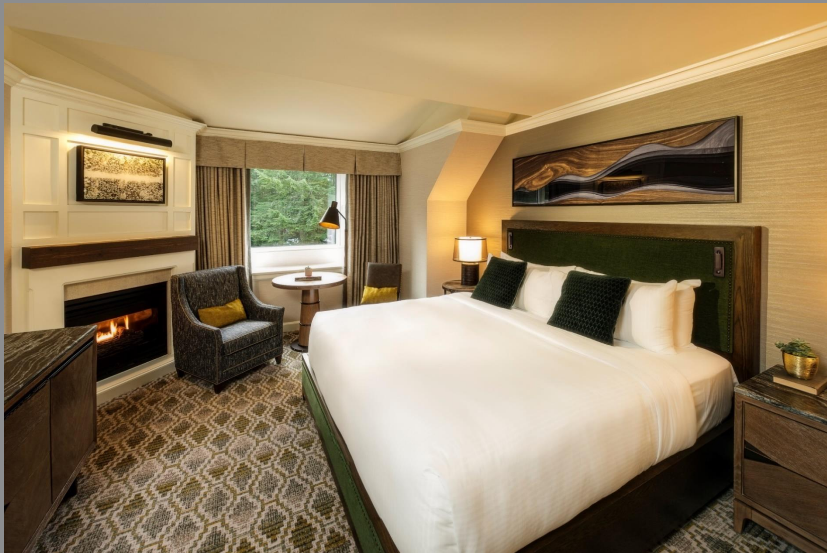
Newly expanded Fairmont Gold floor – renovated guestroom