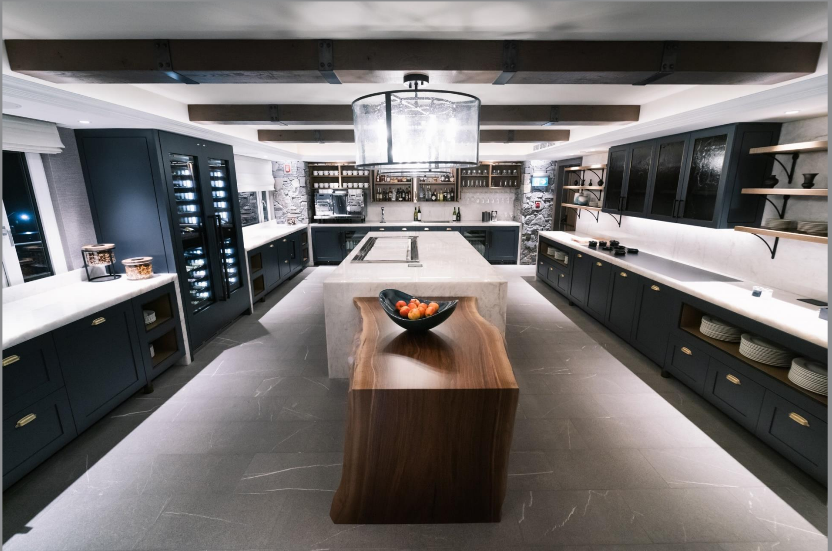
Newly expanded Fairmont Gold floor – Pantry