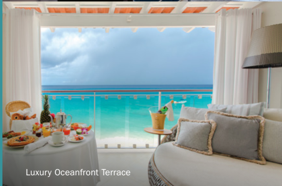
Luxury Oceanfront Terrace