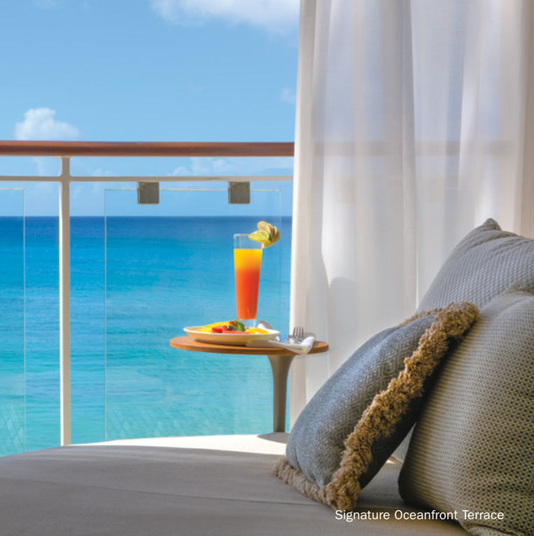
Signature Oceanfront Terrace