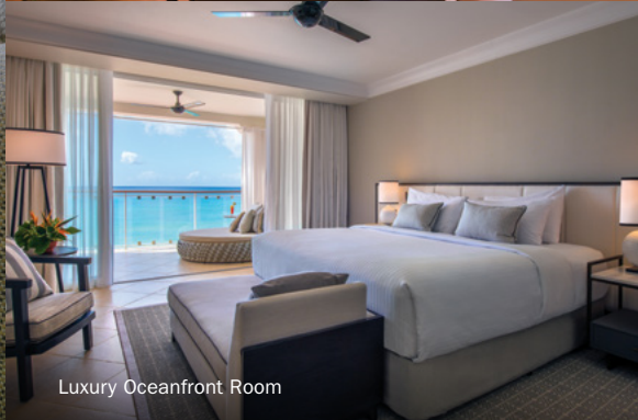
Luxury Oceanfront Room