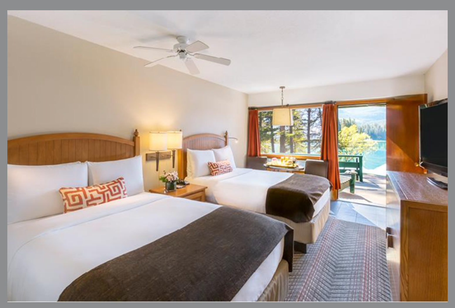
Fairmont Lakeview Room