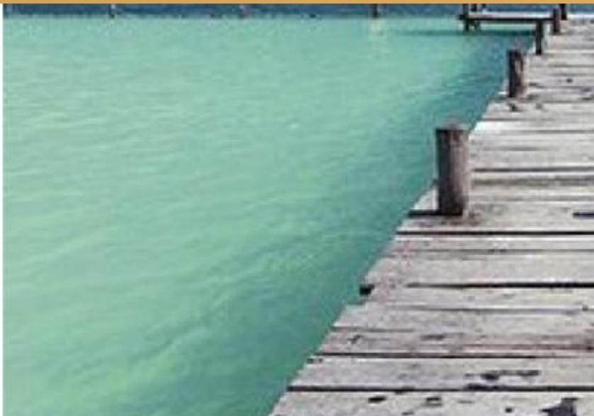
BABY BLUE LAGOON