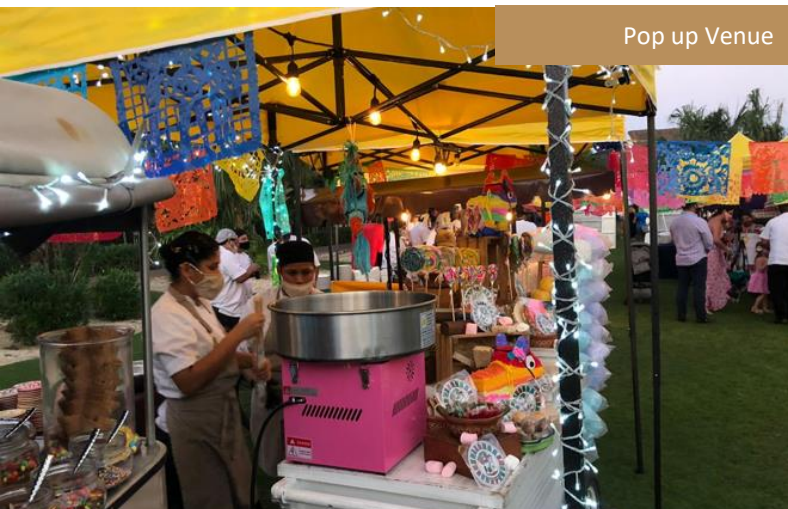
Pop up Venue