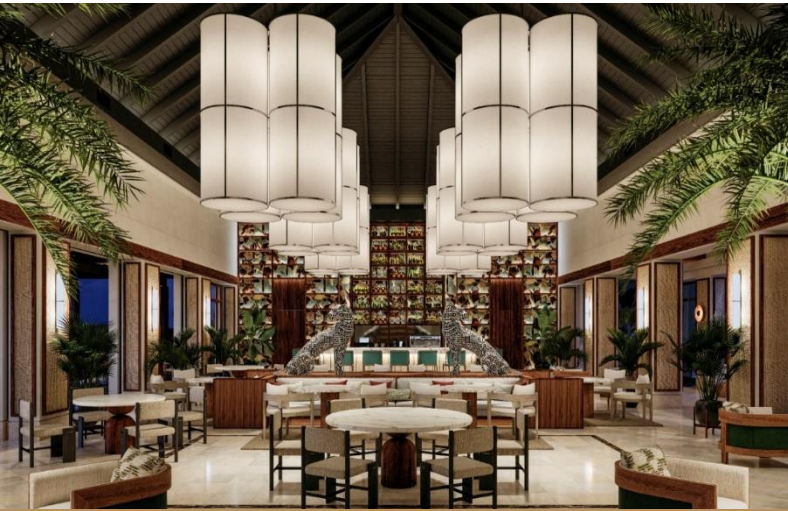
HIX BAR & LOUNGE